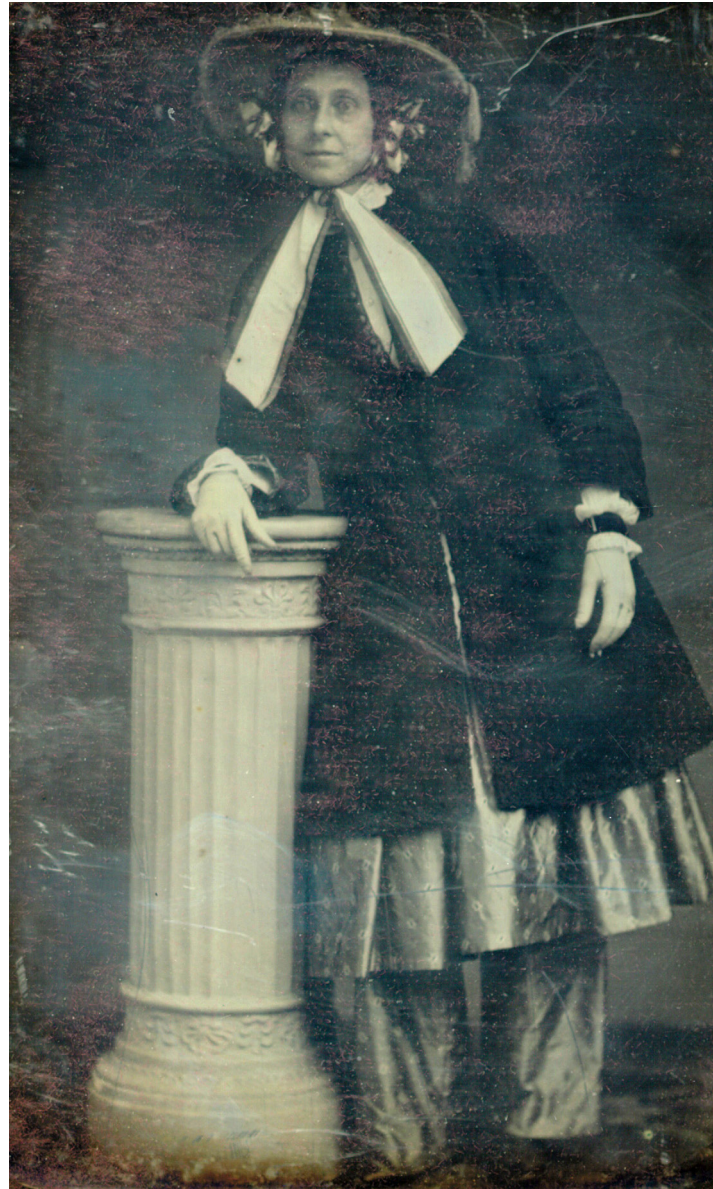
Amelia Jenks Bloomer, 1850s. Daguerreotype.

Amelia’s interest in temperance began before she married Dexter Bloomer, who gave up alcohol after their wedding. They were part of a growing movement that had formed in the 1820s, as American alcohol consumption reached an all-time high. In temperance circles, drinking was viewed as immoral, un-Christian, and destructive of family life. Temperance reform was seen as a moral issue, well within women’s sphere, but it was also an opportunity to grapple