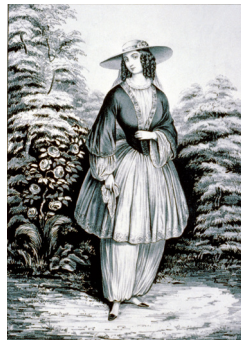
N. Currier (firm), The Bloomer Costume , 1851. Lithograph. Library of Congress Prints and Photographs Division, Washington, D.C., 90711963.

Mrs. Stanton was a big personality, confident and witty. The two worked together on causes that mattered deeply to