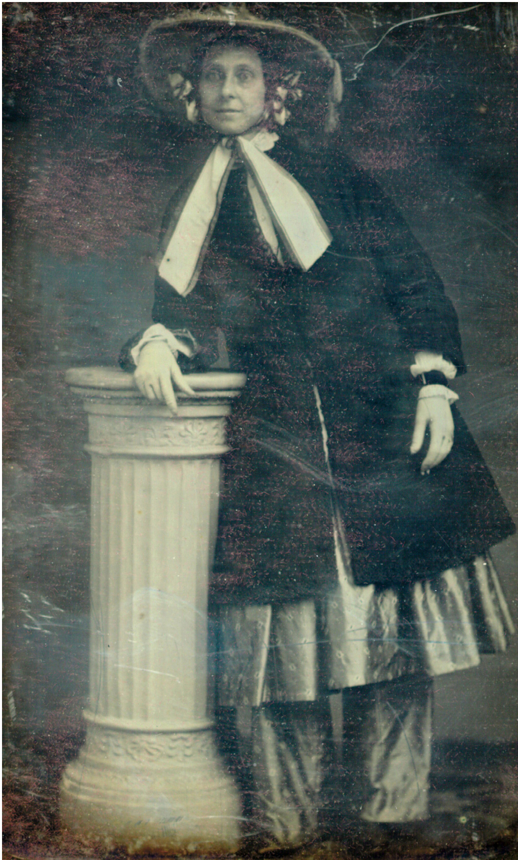
Amelia Jenks Bloomer, 1850s. Daguerreotype.