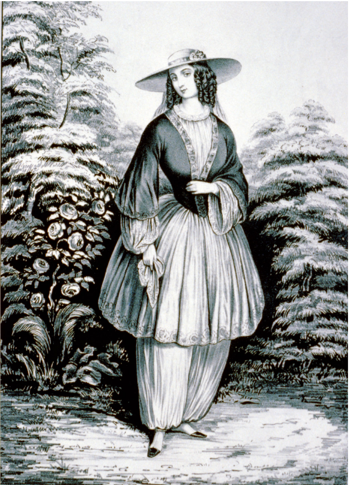
N. Currier (firm), The Bloomer Costume , 1851, Lithograph, Library of Congress Prints and Photographs Division, Washington D.C., 90711963.