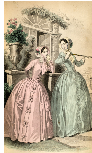
“Godey’s Paris Fashions Americanized,” Godey’s Lady’s Book , July 1848. Hand-colored engraving. New-York Historical Society Library, TX1.G58, vol. 37.

With their husbands working outside the home, and without the farm-wife duties that filled the days of their mothers and grandmothers, the “proper role” of middle-class white women was redefined in the prescriptive literature written for them. New messages appeared in conduct books, ladies’ magazines, religious tracts, and similar publications. Sometimes written by men and sometimes by women, they carried the weight of authority, and defined how middle-class white women should