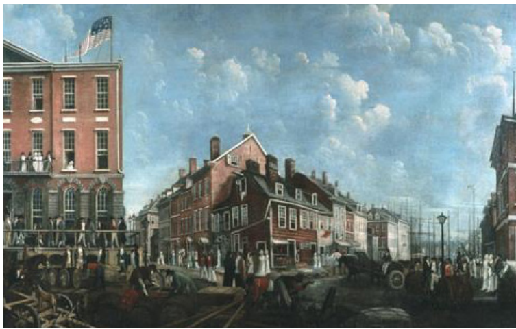
Francis Guy, Tontine Coffee House , New York City, ca. 1797. Oil on linen. New-York Historical Society, Purchase, The Louis Durr Fund, 1907.32.

It’s impossible to know how individual middle-class white women responded to the many directives that poured their way. Messages sent are not always messages welcomed or acted on. But many women were in