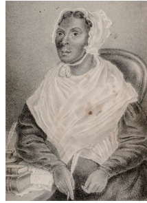
Jarena Lee, 1849. Religious Experience and Journal of Mrs. Jarena Lee: giving an account of her call to preach the gospel , frontispiece. Engraving. New-York Historical Society Library, C1LA784 A3 1849.

In the Second Great Awakening (1790s–1840s), itinerant preachers traveled the countryside and converted thousands, especially